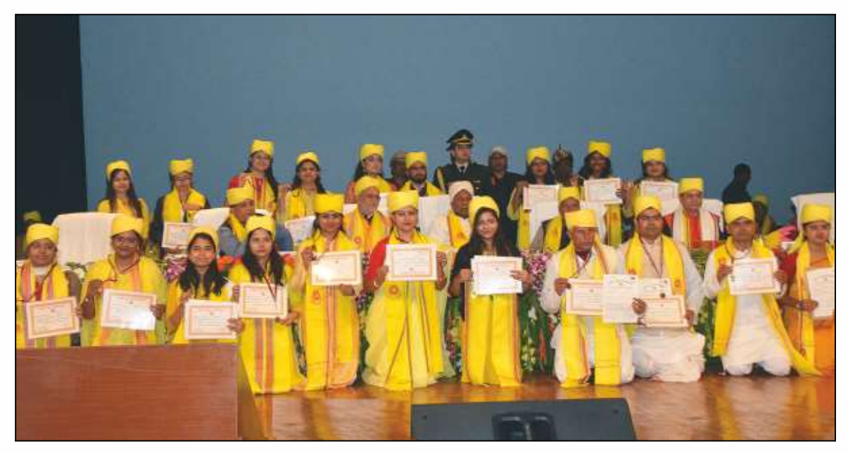
Recipient of Gold Medals in 14th Convocation of the University

decided by the Vice Chancellor from time to time, Fee shall be paid in the form of a Demand Draft drawn in favour of Nalanda Open University and payable at Patna.