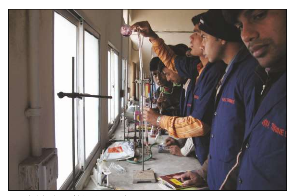
A practical class is on with hands on experiments

The abstract of the syllabi of the Master's Degree courses, in Science subjects (subjectwise), is given in following pages.