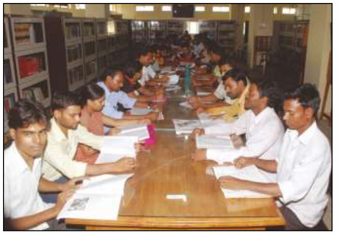
A view of the Reading Hall of University Library

Each successful candidate is given a formal certificate in the prescribed form, specifying the class/division in which he/she has passed. The