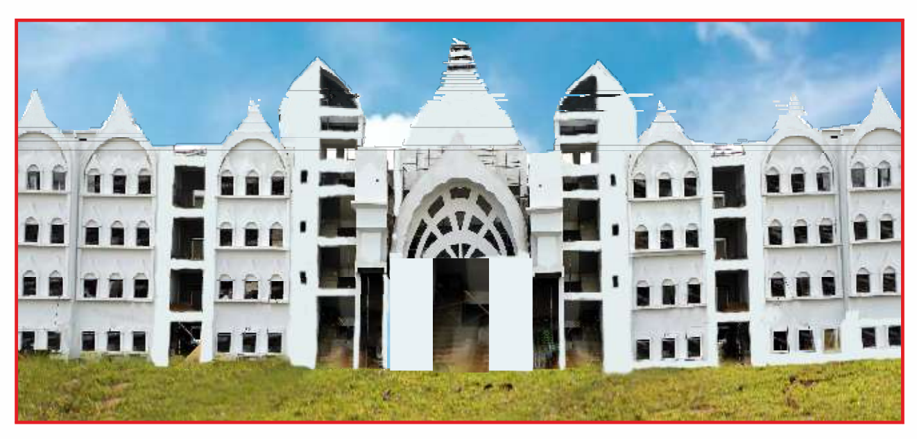
Proposed New Building of Nalanda Open University at Nalanda

The university has an air-conditioned electronically controlled examination centre for about 1000 examinees and a state of the art library, with about 100,000 titles.