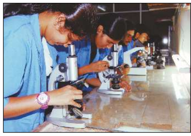
A view of the Science Laboratory in the University