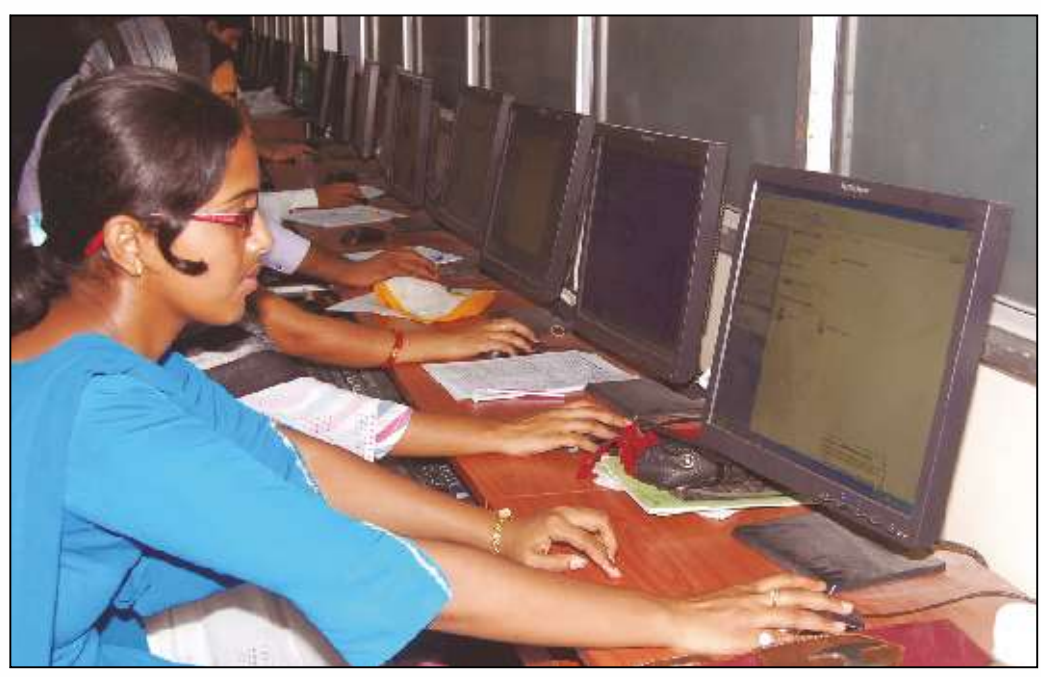
A Computer Class in progress

में डालकर लिफाफा सील कर दें। तत्पश्चात, लिफाफे पर भी अपना नाम, नामांकन संख्या, पत्र संख्या इत्यादि लिख दें। उनसे अनुरोध है कि सीलबन्द लिफाफें को वे सम्बन्धित पत्र की लिखित परीक्षा के दिन अपने साथ परीक्षा केन्द्र पर लेते आयें, अर्थात्, जिस दिन प्रथम पत्र की लिखित परीक्षा हो, उस दिन वे प्रथम पत्र से सम्बद्ध सत्रीय- कार्य की उत्तर-पुस्तिका का सील्ड लिफाफा अपने साथ परीक्षा हॉल में लाएँ और उसे अपनी सीट पर रख लें। इसी प्रकार, जिस दिन द्वितीय पत्र की लिखित परीक्षा हो, उस दिन वे द्वितीय पत्र से सम्बन्धित सत्रीय-कार्य की उत्तर-पुस्तिका का सील्ड लिफाफा लाएँ। तदनुसार, अन्य पत्रों की लिखित परीक्षा के दिन, उन पत्रों से सम्बन्धित सील्ड लिफाफों को अपने साथ लाएँ और परीक्षा कक्ष में अपनी सीट पर रख लें। प्रत्येक दिन वीक्षकगण आपकी सीट से आपका सील्ड लिफाफा संग्रह कर लेंगे और उपस्थित पंजी पर आपके हस्ताक्षर ले लेंगे, जो इस बात का प्रमाण होगा कि आपने उस पत्र के लिए अपना सत्रीय कार्य जमा कर दिया है। सत्रीय कार्य की उत्तर पुस्तिका को किसी भी हालात में डाक या क्रियर से नहीं भेजें। किसी भी स्थिति में विश्वविद्यालय द्वारा डाक अथवा कूरियर से भेजी गई उत्तर पुस्तिका स्वीकार नहीं करेगा।