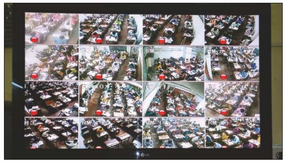
CCTV monitoring of examinees

formal certificate is issued at the convocation, but in case the convocation has not been held for some reason, the University may issue a provisional certificate to any student on payment of Rs. 200.00 only. All certificates are bi-lingual i.e. both in English and Hindi. The fee charged for issue of a formal certificate at the time of convocation is Rs. 1000.00, which includes the cost incurred on holding of convocation and other miscellaneous expenses, such as, the cost of hand made paper, printing expenses etc.