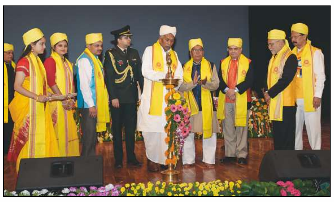
H.E. Governor Hon'ble Fagu Chauhan lighting the ceremonial lamp to inaugurate the 14th Convocation

Master's Degree courses in Arts subjects are offered in 18 subjects. These courses are of 2 year duration and each course consists of 16 papers, divided into two parts of 8 papers for Part I and another 8 papers for Part II of the study