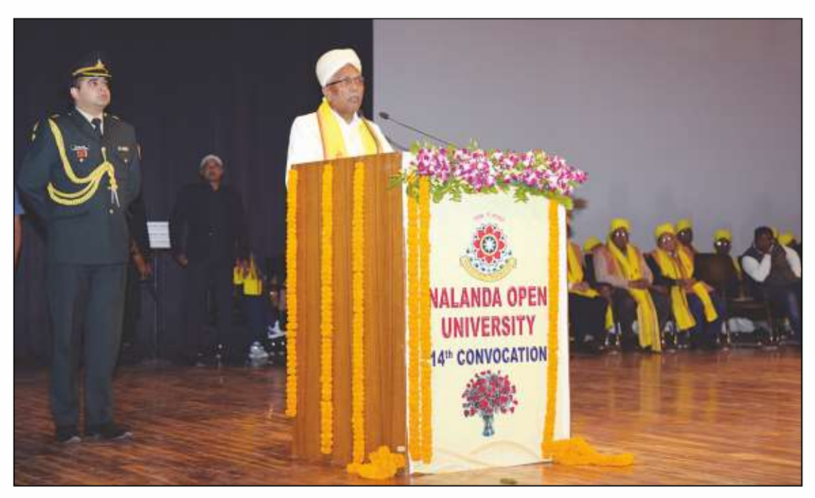
H.E. Governor Hon'ble Fagu Chauhan addressing in 14th Convocation of the University

shall be in a ratio of 80:20 respectively as is given in the details of different papers of each programme. Term-end final examination will be held at the end of each Academic session. As per new rules it will be necessary for all students to pass in each Part of the examination separately before they are promoted to the other Part. Further, in order to pass each Part of the examination, every student will be required to secure at least 33% of marks in each paper. Consisting of both the term end written examination and practical examination/ home assignment, as the case may be, taken together and percentage determined accordingly. However, if a candidate has failed to appear and secured zero mark in the term end written examination or practical examination/home assignment, as the case may be, in any paper, he/she will be deemed to have failed in that paper. Failure in one paper will mean failure in examination. Hence students must strive hard to pass in all the papers separately.