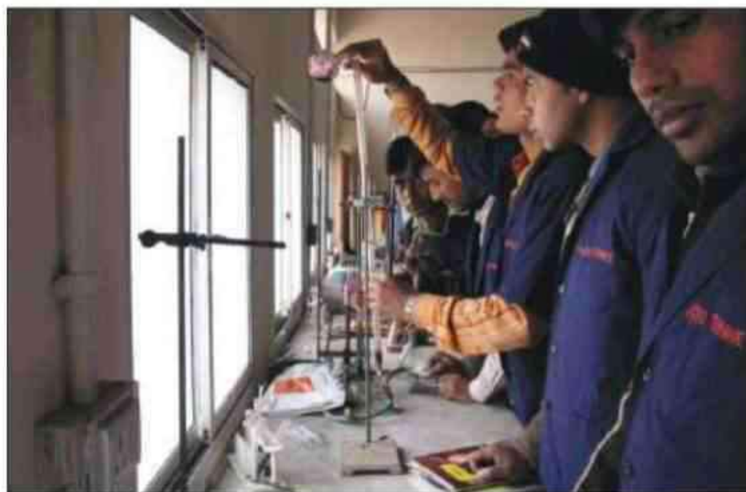
A practical class is on with hands on experiments

The abstract of the syllabi of the Master's Degree courses, in Science subjects (subject-wise), is given in following pages.