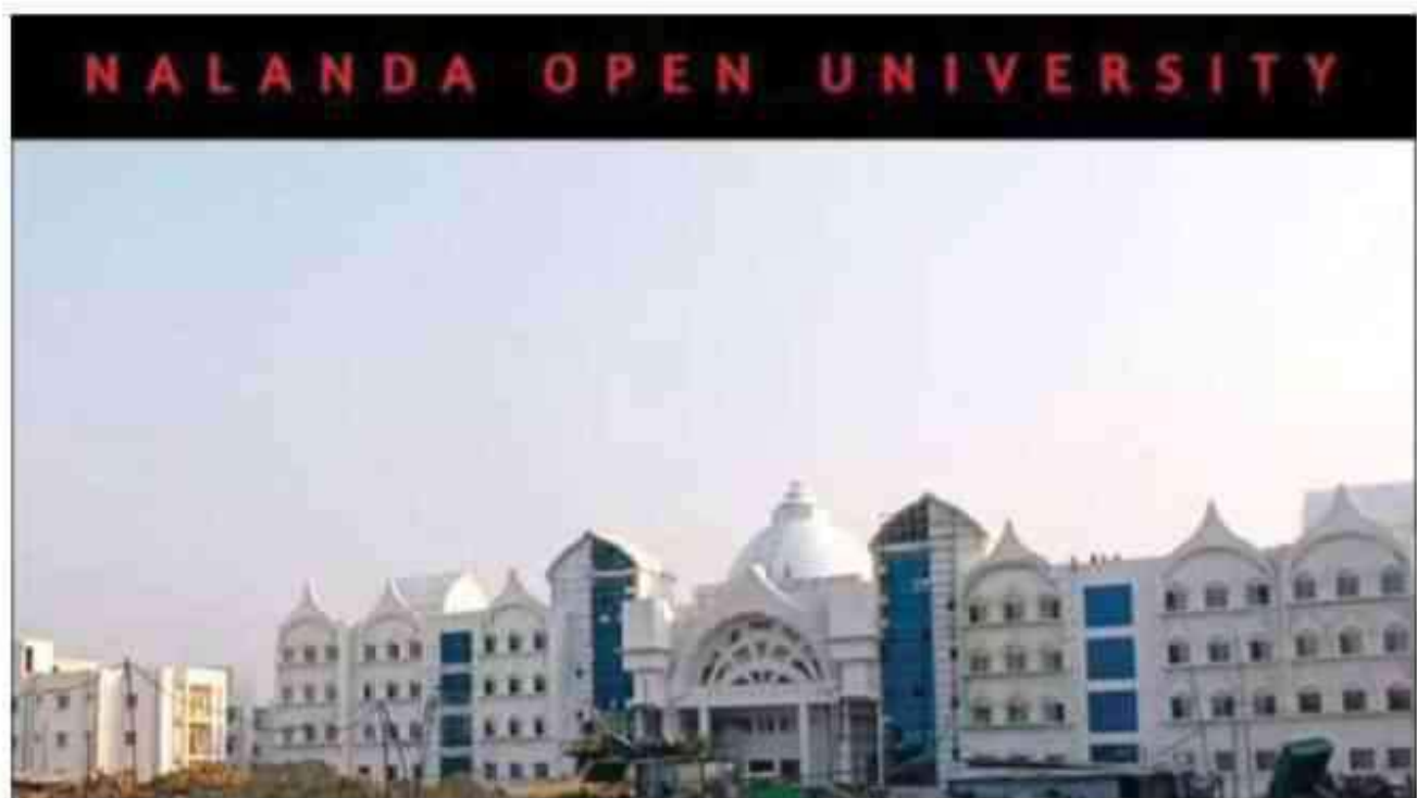
New Building of Nalanda Open University at Nalanda

The university has an air-conditioned electronically controlled examination centre for about 1000 examinees and a state of the art library, with about 100,000 titles.