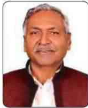
CHANCELLOR H.E. Shri Fagu Chauhan Hon'ble Governor, Bihar