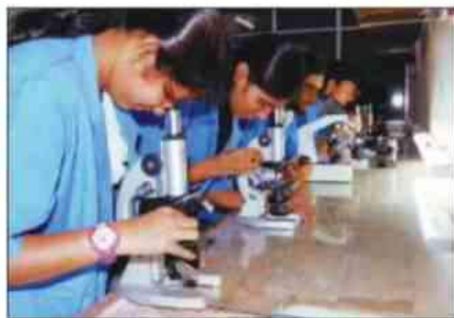
A view of the Science Laboratory in the University