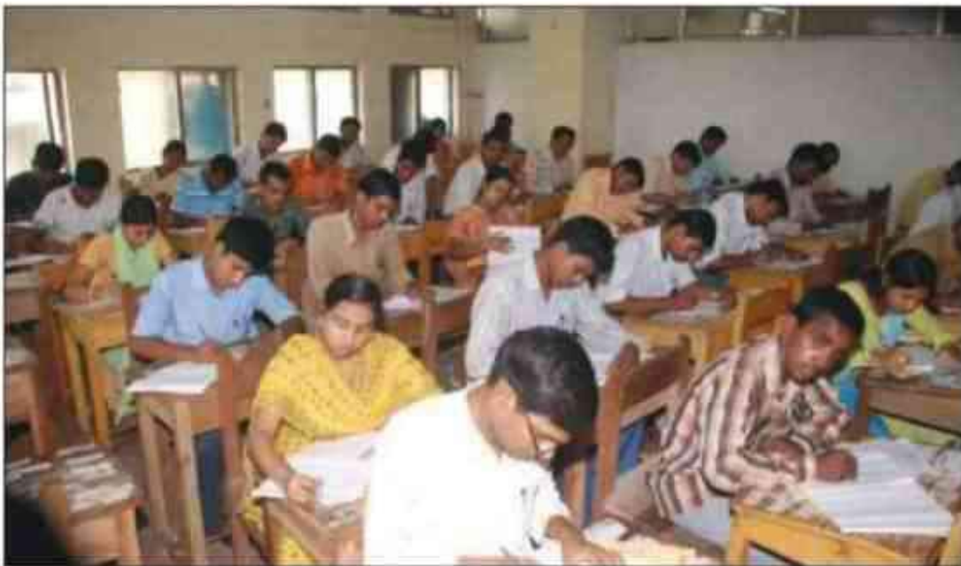
A view of the ongoing examination at our examination centre

The dates of examinations, as given in para 39 (A) above, are almost final and will not be changed except for some very grave reasons of which students will be informed separately through advertisement in the newspapers. The students should, therefore, prepare themselves, to appear at the forthcoming examinations as per above given schedule.