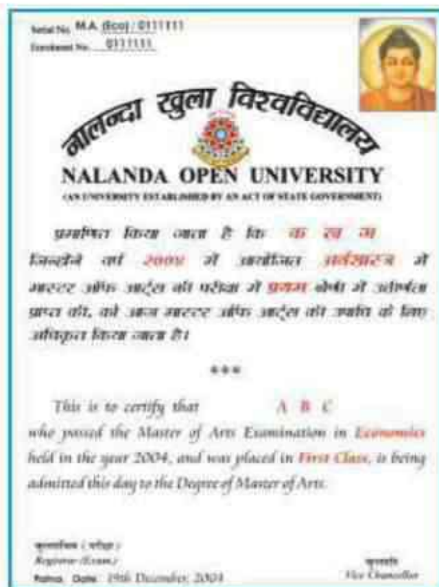
A prototype of the NOU Certificate

The examination is monitored throughout on closed circuit TV cameras, with facilities for continuous video recording. As such, no copying or cheating is possible and any examinee indulging in any type of malpractice is caught immediately with incontrovertible evidence of his/her malpractice having been recorded on tape. Hence, examinees are advised to come prepared to answer their