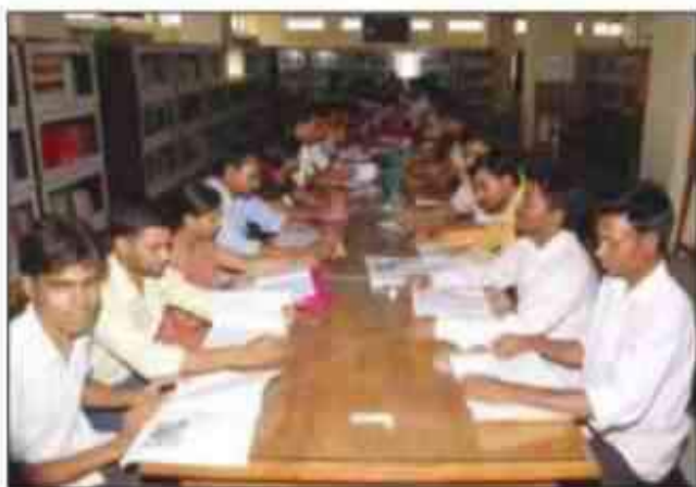
A view of the Reading Hall of University Library

The examination is monitored throughout on closed circuit TV cameras, with facilities for continuous video recording. As such, no copying or cheating is possible and any examinee indulging in any type of malpractice is caught immediately with incontrovertible evidence of his/her malpractice having been recorded on tape. Hence, examinees are advised to come prepared to answer their examination in a totally fair and un-blemished manner as there is no scope of cheating or malpractice. The examination centre can house upto 1000