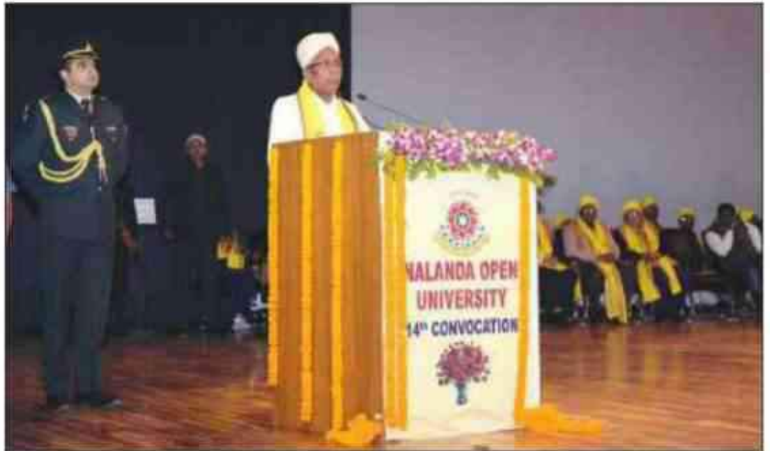
H.E. Governor Hon'ble Fagu Chauhan addressing in 14th Convocation of the University

नालन्दा खुला विश्वविद्यालय से सम्बद्ध सभी महत्वपूर्ण कार्यक्रमों, सूचनाओं, विज्ञापनों इत्यादि का प्रकाशन, आवश्यकतानुसार 'दैनिक जागरण', 'प्रभात खबर' अथवा 'दैनिक हिन्दुस्तान' समाचारपत्रों में किया जायेगा। विद्यार्थियों