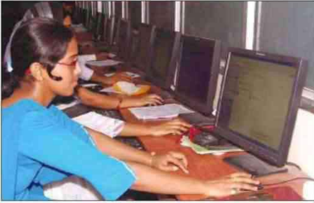
A Computer Class in progress

परीक्षा केन्द्र पर लेते आये, अर्थात्, जिस दिन प्रथम पत्र की लिखित परीक्षा हो, उस दिन वे प्रथम पत्र से सम्बद्ध सत्रीय-कार्य की उत्तर-पुस्तिका का सील्ड लिफाफा अपने साथ परीक्षा हॉल में लाएँ और उसे अपनी सीट पर रख लें। इसी प्रकार, जिस दिन द्वितीय पत्र की लिखित परीक्षा हो, उस दिन वे द्वितीय पत्र से सम्बन्धित सत्रीय-कार्य की उत्तर-पुस्तिका का सील्ड लिफाफा लाएँ। तदनुसार, अन्य पत्रों की लिखित परीक्षा के दिन, उन पत्रों से सम्बन्धित सील्ड लिफाफों को अपने साथ लाएँ और परीक्षा कक्ष में अपनी सीट पर रख लें। प्रत्येक दिन वीक्षकगण आपकी सीट से आपका सील्ड लिफाफा संग्रह कर लेंगे और उपस्थित पंजी पर आपके हस्ताक्षर ले लेंगे, जो इस बात का प्रमाण होगा कि आपने उस पत्र के लिए अपना सत्रीय कार्य जमा कर दिया है। सत्रीय कार्य की उत्तर पुस्तिका को किसी भी हालात में डाक या कूरियर से नहीं भेजें। किसी भी स्थिति में विश्वविद्यालय द्वारा डाक अथवा कूरियर से भेजी गई उत्तर पुस्तिका स्वीकार नहीं करेगा।