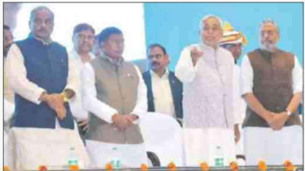
Hon'ble Mr. Nitish Kumar, Chief Minister of Bihar laying the foundation stone of NOU's new campus