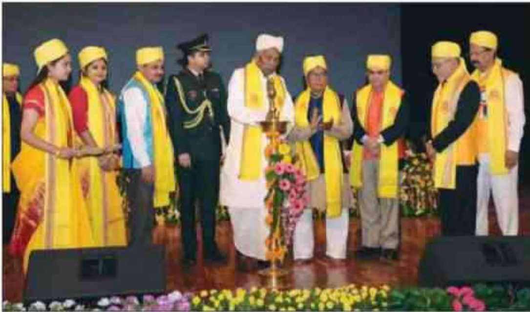
H.E. Governor Hon'ble Fagu Chauhan lighting the ceremonial lamp to inaugurate the 14th Convocation