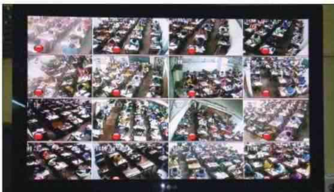
CCTV monitoring of examinees